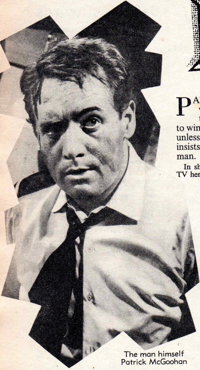
The man himself Patrick McGooohan

P AT MCGOOHAN is an actor who likes his fights planned to the last punch. He hates to win against overwhelming odds unless he deserves to do so. He insists on brawling like a gentleman.