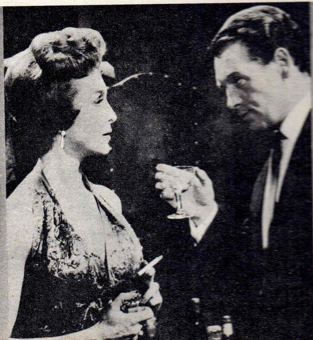
He toasts Maxine Audley in "Colonel Rod- riguez" (left)