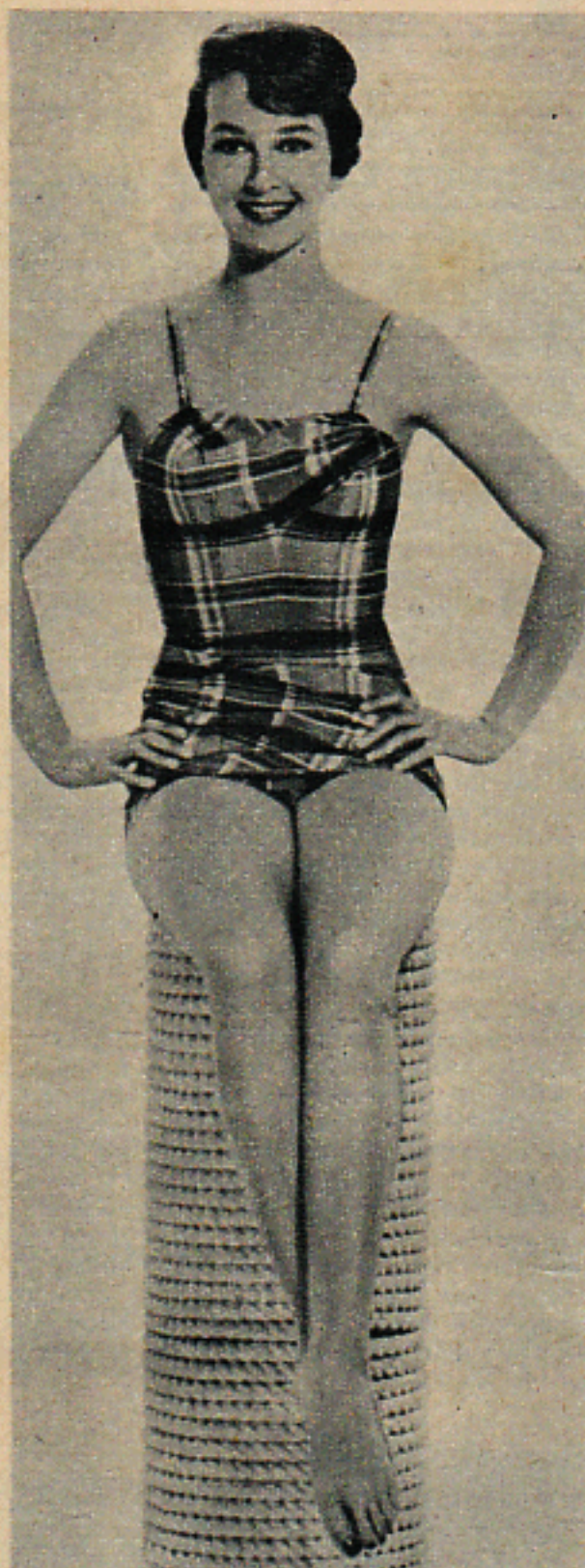
Taina Elg took time off from Imitation General , with Glenn Ford, to model swimwear